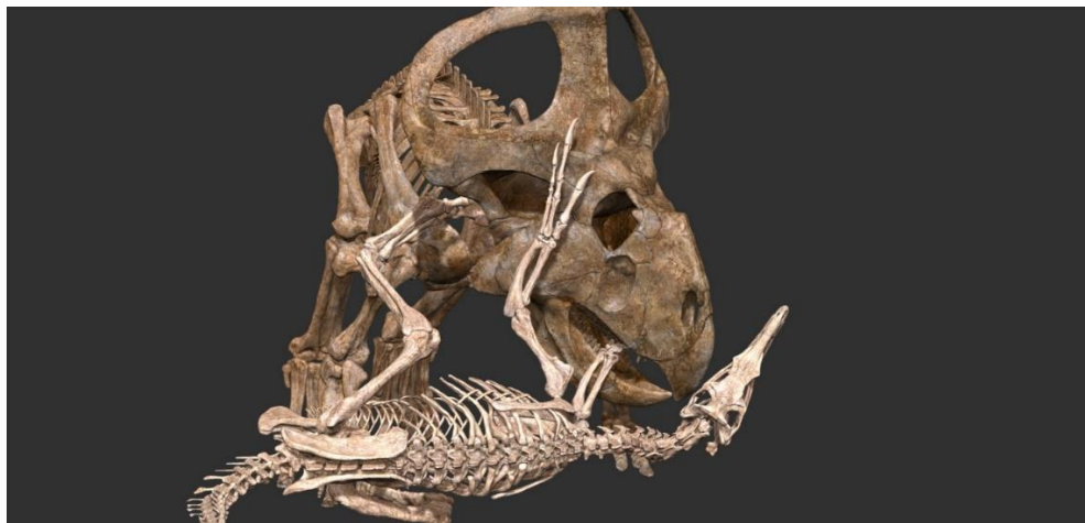
The “fighting dinosaurs” fossil of a Velociraptor and Protoceratops locked in mortal combat